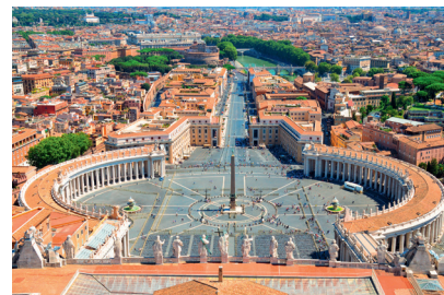
St Peter's Square