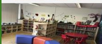
Our amazing Reading Room

Children will continue to visit our 'Reading Room' where they will read for pleasure, individually or in small groups and will have the opportunity to choose a book to bring home and share.